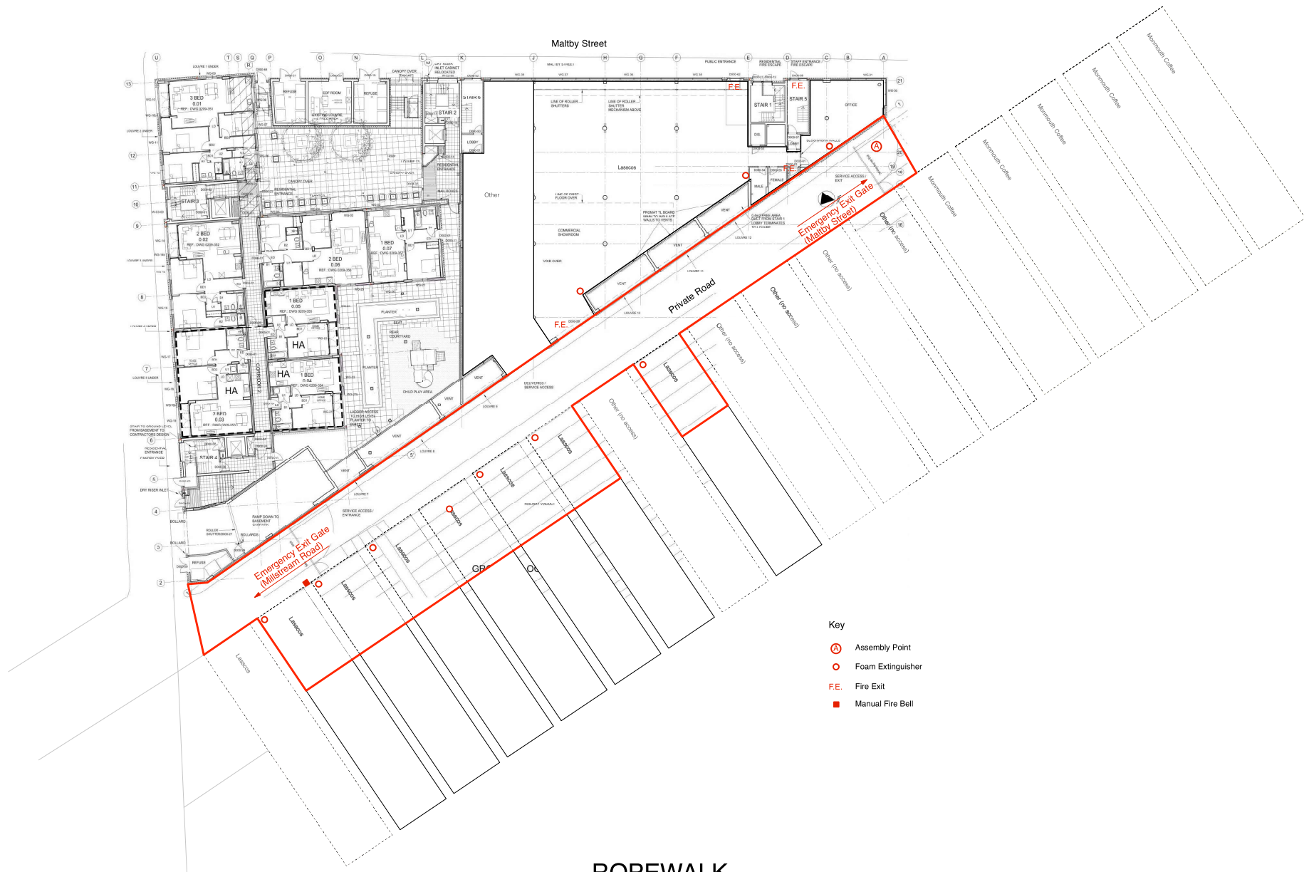
ROPEWALK PROPOSED LICENSED AREA SCALE 1:200 @ A1